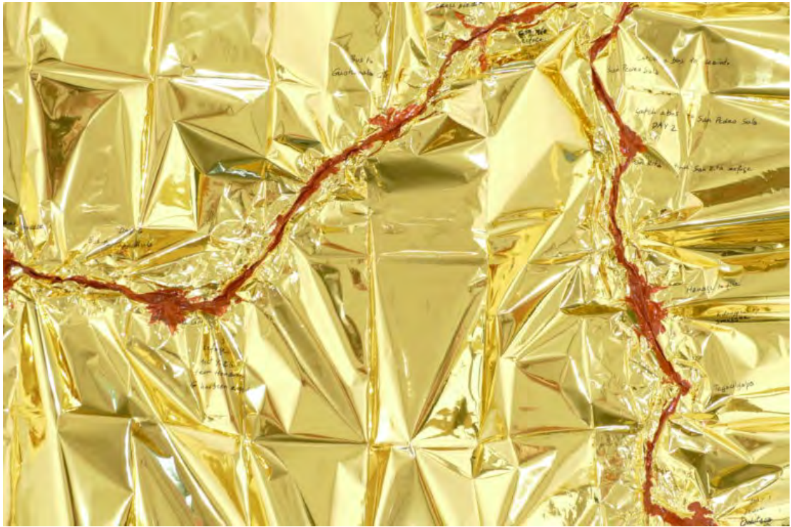
Lucile Bertrand, Survival Route, detail. Acrylic paint and pen felt on rescue blanket. 82 x 63 inches (210 x 160 cm).

So the pathos of the events forcing people to become refugees emigrating to places far away from where they came is several removes from the art. The work thus raises an interesting question: How do we empathize with people whose lives have been documented with a line on a map? Inevitably, we have to know what has happened to them, more than likely before we see the art. Bertrand risks losing touch with the distress she wishes to communicate because the journeys are so intellectually visualized. On the other hand, by conceptualizing the mapped journeys as markers of public and private turmoil, she gains a breadth of view that a close focus on a particular person would not achieve.