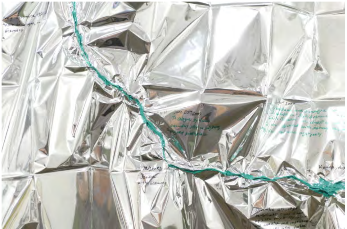
Lucile Bertrand, Touristic Route, detail. Acrylic paint and pen felt on rescue blanket. 82 x 63 inches (210 x 160 cm).

example, she notes the difficulty and the length of time required for a Palestinian man traveling from the West Bank to Tel Aviv in order to work on a construction site. Or a Jewish woman revisiting the cities she had passed through on a journey that of necessity began in Vienna in 1938 and made its way through Germany, France, and Switzerland. Or a Honduras woman traveling close to two thousand miles alone from Choluteca to Houston so as to reunite with her husband and son in the United States. Retelling these stories through drawings and lines following their passage on maps indicate the extreme hardship their travel incurred. Interestingly, the experience of viewing the works of art is as conceptual as it is visual—clearly the result of a conscious decision on Bertrand's part. In her refusal to personalize the ordeal of the travelers by depicting them directly, she distances herself from a realistic portrayal of their struggle.