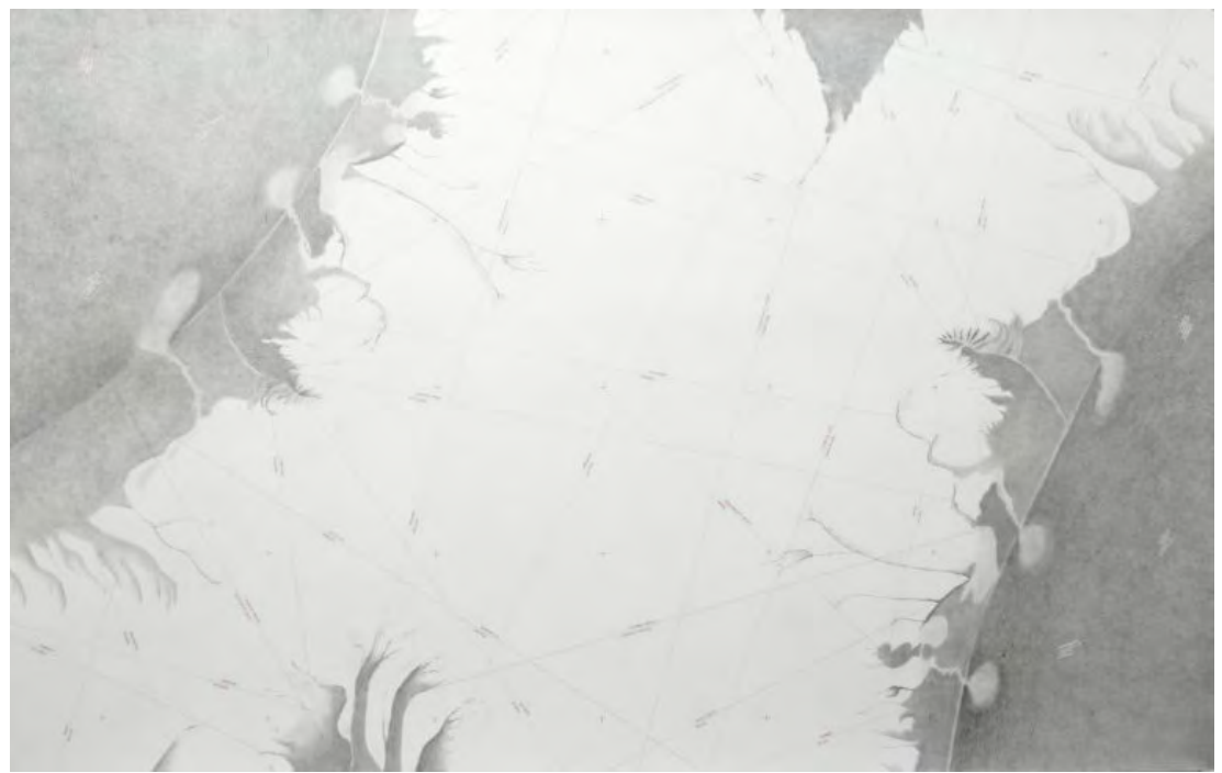
Lucile Bertrand, Matter Of Perspective, 2017. Graphite and printed text on paper. 39 x 59 in (100 x 150 cm).

criminal. I just want to work." These quotations and other are displayed alongside the meandering lines of travel (green for the pianist; red for the worker), accentuating the double state Israel has become. The contrast is tragic, but it is also more than tragic. As the two quotations suggest, we know that there are two kinds of lives being lived in Israel: that of Jewish people and that of Palestinian people. Bertrand makes no claims for violent upheaval, but the Palestinian worker's hardship, which he describes succinctly and without self-pity, can easily be seen as the basis of an angry insurgency.