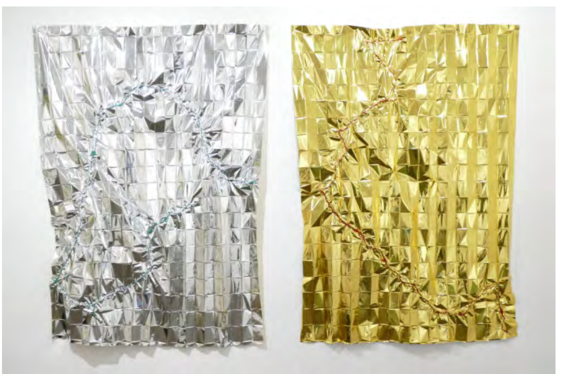
Lucile Bertrand, Touristic Route/Survival Route, 2017. Acrylic paint and pen felt on rescue blankets. 82 x 63 inches (210 x 160 cm) each.

Lucile Bertrand, an artist originally from France but now living in Brussels, offered a strong show that mixed stories of extended or difficult travel by persons adversely afflicted by social conditions, war, or the necessity of work, among other circumstances. She has written: "I would like to question false evidences about the accessibility and use of landscape and space to all." Her point is well taken; for